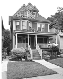
NYS DOS | Local Government 23