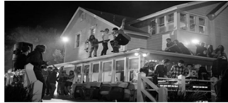
NYS DOS | Local Government 8