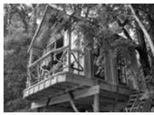
Tree House, Washington County