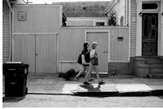
NYS DOS | Local Government 7