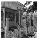
Watkins Glen, Schuyler County