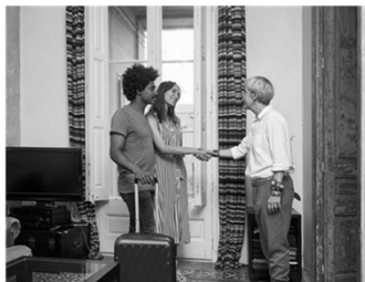
NYS DOS | Local Government 9