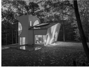
NYS DOS | Local Government 22