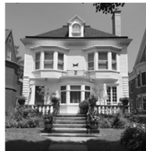
NYS DOS | Local Government 24